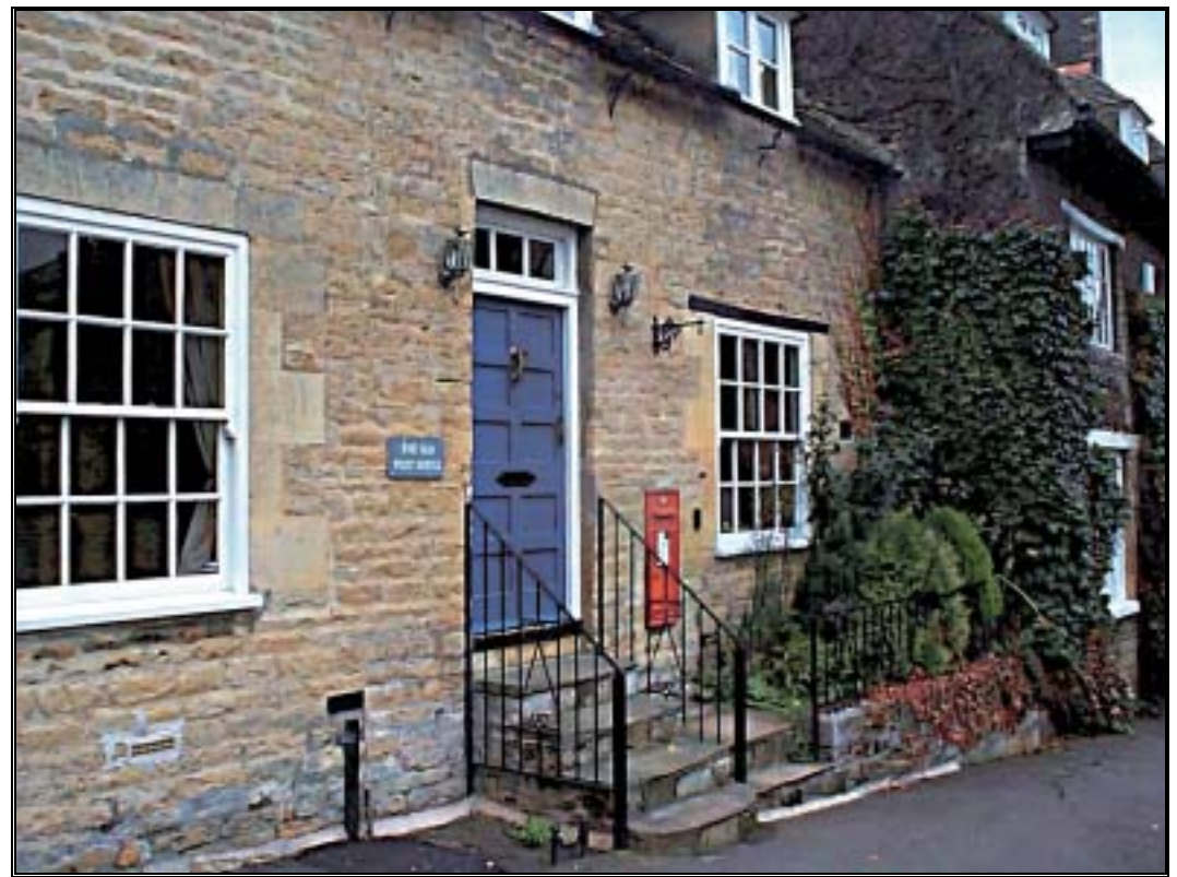
The Old Post Office and Stores, Bridge End.

A number of stables, barns and outhouses contiguous to the rear of Bridge End were sympathetically converted into highly desirable residences with riverside gardens in 1977 and named Riverside Spinney, with access from Peterborough Road. These conversions retained much of the original oak timbers and stone, under Collyweston slates. The only other visible vestiges of the old wharf are a flight of steps and a length of wall in the lower garden of Bedford House.