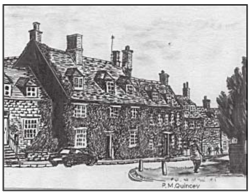
Church House, Bridge End

A Conservation Area is defined in the Planning (Listed Buildings and Conservation Areas) Act 1990 as an ' area of special architectural interest the character or appearance of which it is desirable to preserve or enhance '. For general guidance purposes, there is a map delineating the Wansford Conservation Area on page 8 of this pamphlet.