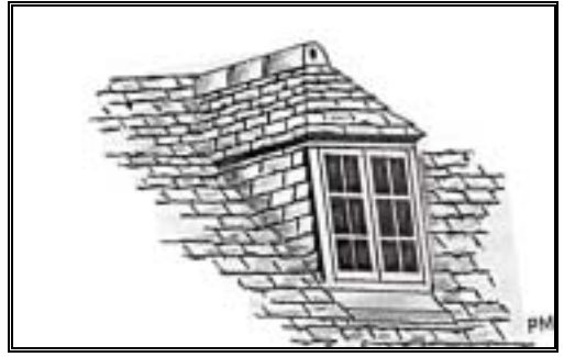
Dormer Window feature, Bridge End

These attractive properties can be dated generally from about the 17<sup>th</sup> and 18<sup>th</sup> centuries, with Wharf House dated circa 1650; but parts undoubtedly may be earlier. Formerly used principally for commercial and professional purposes, they are today exclusively residential. Number 1, on the corner of Bridge End and Peterborough Road, was the original Wansford Post Office until that facility first moved opposite The Haycock about 40 years ago. The original post box in the front wall of the house remains a village landmark.