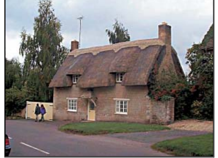
Meadow Cottage, Bridge End

'Meadow Cottage' is the only thatched property in Wansford. It is probably late 16<sup>th</sup> century in origin and provides a warm, rustic charm with its design and outline entirely complementing its location and providing soft contrast to the more formal outline of the buildings opposite. In past centuries, it has been a hostelry - The Cross Keys - and a bake-house. Included in the deeds of Meadow Cottage were once the stone-pits that are today a feature of the front gardens of 23 and 24 Old North Road.