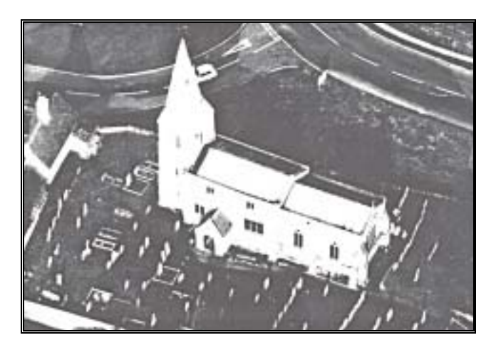
Aerial view of St. Mary the Virgin, Wansford

The parish church, properly a chapel of ease to neighbouring Thornhaugh church, is of considerable antiquity being of Saxon origin, certainly 11<sup>th</sup> century if not earlier. It possibly stands on the site of an earlier, wooden church which – given its location – may have replaced a pre-Christian temple or place of ritual. St. Mary's is strategically situated in a dominant position at the top of the northern slope rising from the old bridge. It is also set at the nodal point of the former Great North Road, the former Leicester Road, also Wansford Road that wends via Yarwell and Nassington to Fotheringhay and Oundle. Outside the church, close to the junction with Yarwell Road once stood stocks and a whipping post. The village pound, where stray livestock were impounded by the parish and returned upon payment of a fine, was also situated close by in what is now the garden of 'Holystones'.