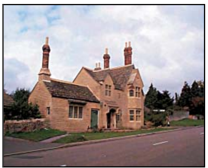
Hillside (Cooper's Cottage), Old North Road

'Hillside' (Cooper's Cottage), 19 Old North Road, is one of the most picturesque buildings in Wansford. This cottage formed part of the Duke of Bedford's Wansford Estate and was built in 1850 to house the family of George Eayrs, the local estate cooper. His initials are seen inscribed on a carved, stone barrel on the gabled front elevation along with the Duke's coat-of-arms. The date 1850 may be seen on the spandrel of the porch. The single storey former cooper's workshop is still evident attached to the left elevation of the building.