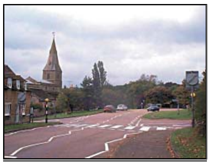
Approaching the Village Green from the east, along Peterborough Road

A village notice board is supported against the churchyard wall. A Post Office mail storage facility and a road grit bin are sited at the western edge of the green, close to the Yarwell Road junction. On the opposite side of the road, a grassy bank rises from the footpath to the stone boundary wall of "Greystoke" where there is a bench seat and a litterbin. This welcome open space offers a wide and most pleasing perspective of the church and down Bridge End towards the river. However, in recent years the growth of a large willow and other trees just below "Meadow Cottage" has denied the view across the field to the river and beyond.