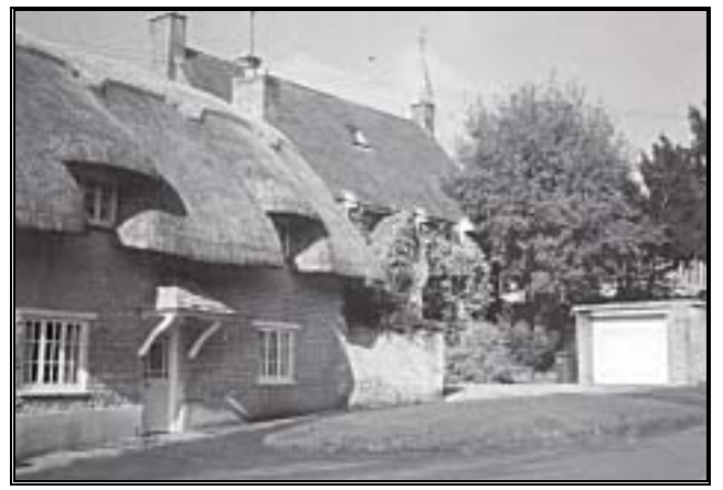
Loss of view due to building and vegetation - see p.10