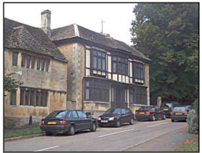
Greystoke (left) and 3, Old North Road. The 1657 date-stone is just out of camera-shot to left.

'Greystoke', abutting the Old North Road, the Village Green and Old Leicester Road, is quite possibly the oldest residence in Wansford with parts dated to c.1620. Stone built under a tiled roof, a date-stone on the Old North Road frontage reads 1657. This range of dates enables the house to claim the remarkable distinction of being part Jacobean, part Carolean and part Commonwealth at the same time! In the past this property has been a bakery and a maltings, although certain ancillary outbuildings were lost at the time the Mermaid Inn, which stood between 'Greystoke' and the church, was demolished in the late 1930s to facilitate a much needed road-widening scheme.